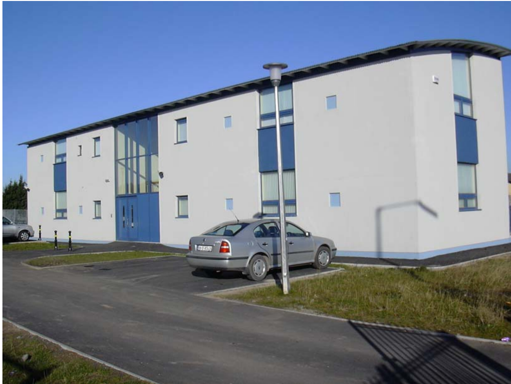
CARP's new building March 2003