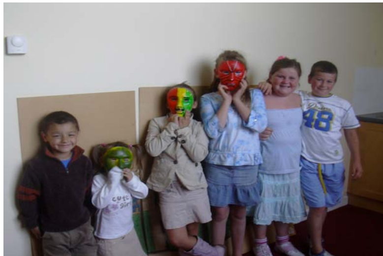
Some children who attended our 10 th Anniversary

Finally, CARP would like to thank all problem drug users who avail of our services. We thank you for your courtesy, kindness and understanding of our limitations. We would like for you to make us redundant but we have to be realistic and acknowledge that problem drug use will continue to be a factor in our lives for the future. However, CARP hopes that it will in some way remove the stigma attached to being a problem drug user and that some time in the future more people will see problem drug use as a human condition and not something for which people should be condemned but rather helped to deal with so that people can get on with the difficult job of life.