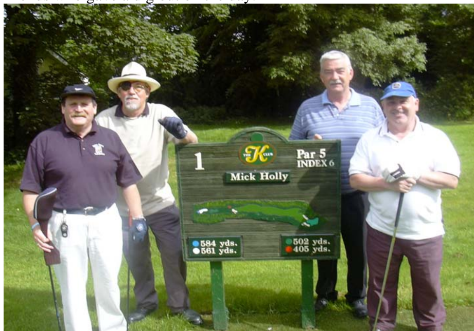
The winning team that took part in our Golf Classic in the K-Club in June 2005.