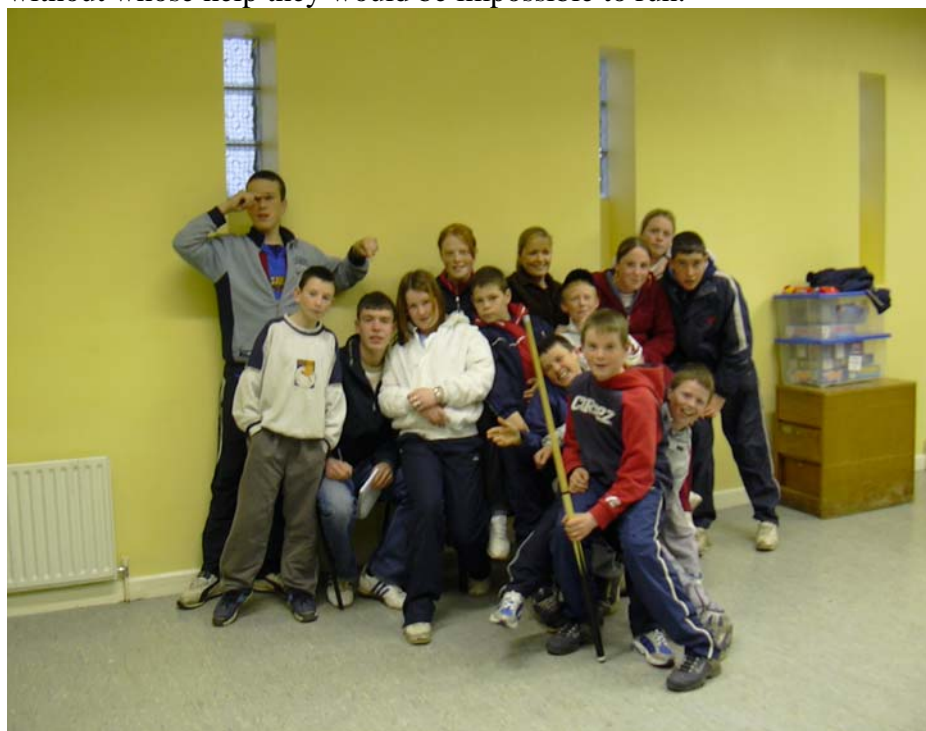
Some of the young people attending the Drop-in

Drop in runs twice weekly from 6pm – 8.30pm in the Nabco Community Centre for young people from the ages of 12-21yrs. We had a group of younger kids attending for a couple of months aged 9-10yrs but this did not work out as the age difference was too great. There are two volunteers helping with the running of the drop-in, without whose help they would be impossible to run.