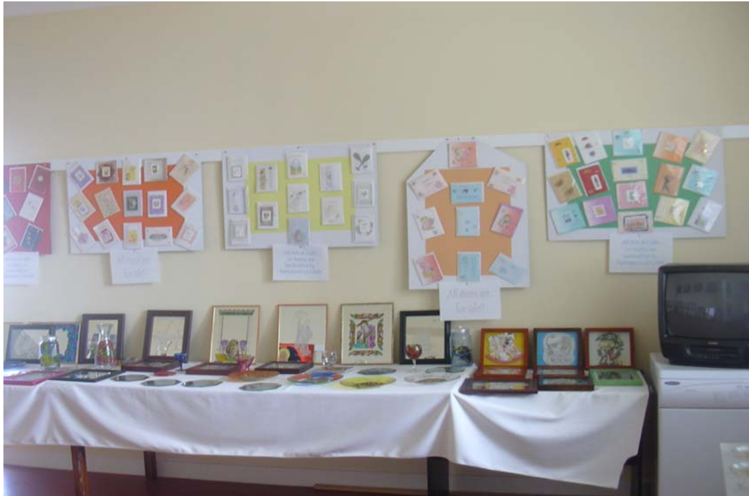
A selection of arts and crafts made by CARP participants

This is done with monies from the Tallaght Local Drugs Task Force. Arts/crafts are held on Mondays and Wednesdays afternoons.